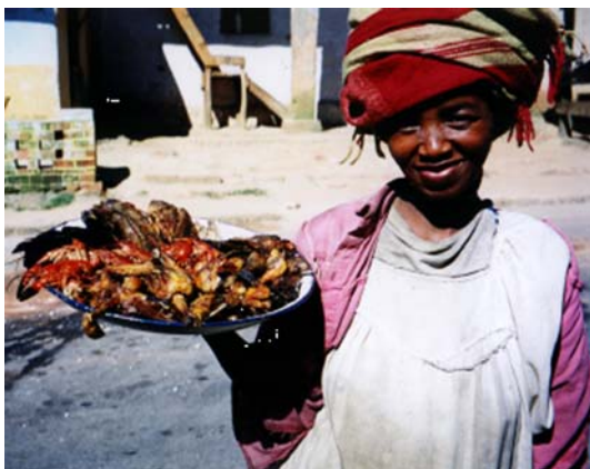
Fig. 4 Crayfish are staple in many cultures both as a food source and source of income; this example is from a roadside crayfish stand in Madagascar with both Astacoides madagascarensis and Astacoides betsiloensis for sale

Freshwater crayfish are a much sought after food item in many cultures (Fig. 4) and a significant aquacultural commodity. Unfortunately for many of the charismatic species (e.g., the Tasmanian Giant Lobster, Astacopsis gouldi ), over-harvesting coupled with degradation of habitat has resulted in the endangerment of many crayfish species (e.g., Horwitz 1994). Other areas, such as Madagascar, support a sustainable harvest of crayfish, yet these populations are typically imperiled by stream degradation (Jones et al. 2005). While all 640+ species of freshwater crayfish have yet to be categorized for conservation status relative to the IUCN Red List Criteria (IUCN 2001), a large number of species already occur on that list. Taylor et al. (1996) found that over 50% of the United States species of freshwater crayfish are endangered or threatened to some degree. Yet, surprising, very few of these species are under national protection with a few more under local (state, provincial) protection. For example, in the United States, 20 species are known from less than five localities (with 15 known only from a single locality) and well over 210 species are considered endangered or threatened, but only four species are listed by the federal government on the Endangered Species List. Native crayfish play an essential role in their native habitat and may act as keystone species for the freshwater ecosystems where they occur. Yet