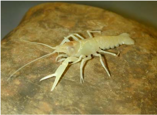
Fig. 1 Orconectes incomptus (Hobbs & Barr 1972), a cave adapted freshwater crayfish from the Cumberland Plateau escarpment in northern Tennessee, USA

crayfish typically has a life span of about 2 years (although some surface and cave species can live beyond 20 years). They reproduce sexually, although hermaphroditic specimens and even parthenogenetic specimens are known to occur (Scholtz et al. 2003). Freshwater crayfishes are omnivorous and typically nocturnal. They are voracious eaters and can be extremely destructive when introduced to non-native habitats. A few freshwater crayfish are particularly invasive (e.g., Orconectes rusticus ) and/or were distributed in the aquaculture trade (e.g., Procambarus clarkii ). These introduced species wreak havoc on natural ecosystems to which they are not native, but the vast majority of freshwater crayfishes are extremely narrowly distributed and hence are endangered due mainly to the destruction of the freshwater ecosystems in general. In this article, we review the freshwater crayfish diversity as it is currently understood and emphasize both the phylogenetic diversity and conservation status of this interesting group of freshwater crustaceans.